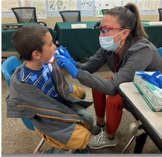
ORAL HEALTH SCREENING