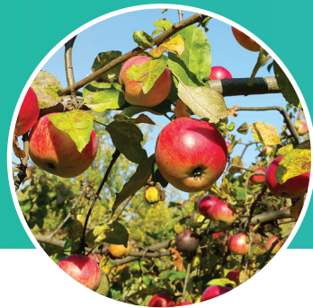
AGRICULTURAL ECONOMY VALUED AT $75M ANNUALLY