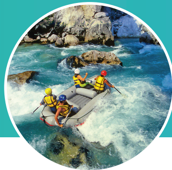
WORLD-CLASS RECREATION DESTINATION