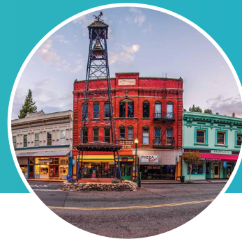
RICH HERITAGE FROM THE GOLD RUSH ERA