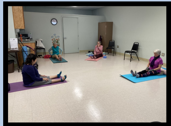
Image of the Yoga Class

Each month we have a volunteer provide one-on-one assistance with a technological device, such as a phone, laptop, or tablet. To attend, call (530) 621-6150 to reserve your time slot. Registration is required!