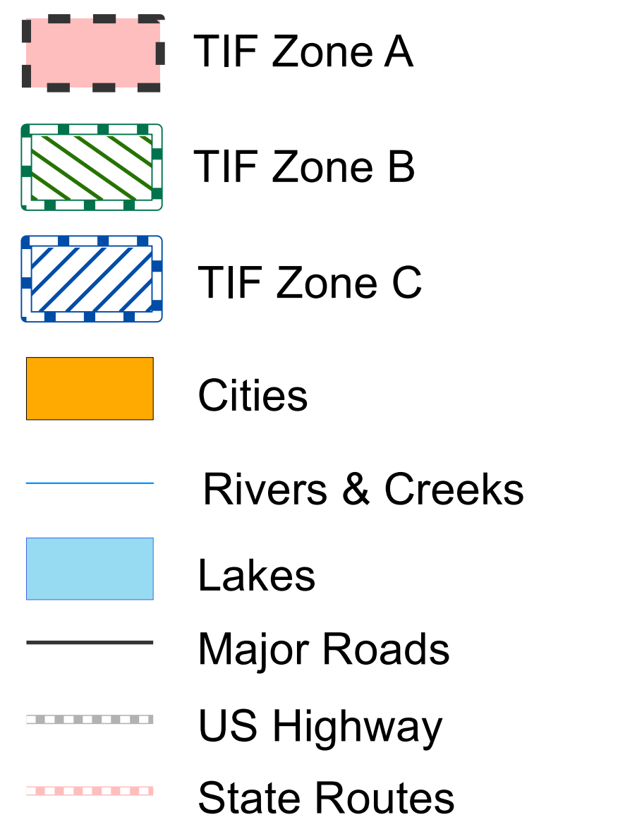
EXHIBIT B Three TIF Zone Map County of El Dorado

DISCLAIMER: THIS DEPICTION WAS COMPILED FROM UNVERIFIED PUBLIC AND PRIVATE SOURCES AND IS ILLUSTRATIVE ONLY. NO REPRESENTATION IS MADE AS TO ACCURACY OF THIS INFORMATION. PARCEL BOUNDARIES ARE PARTICULARLY UNRELIABLE. USERS MAKE USE OF THIS DEPICTION AT THEIR OWN RISK.