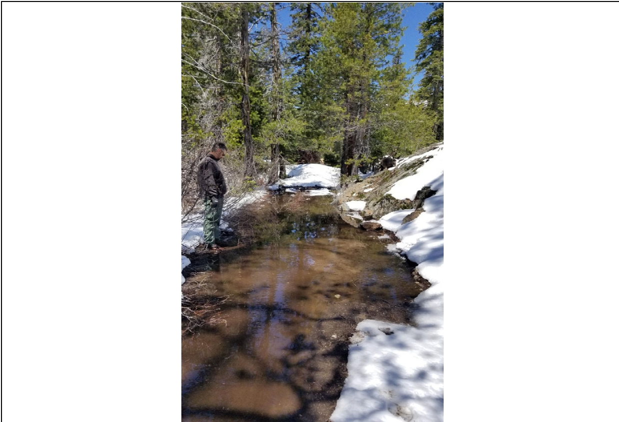
Wentworth Springs Campground