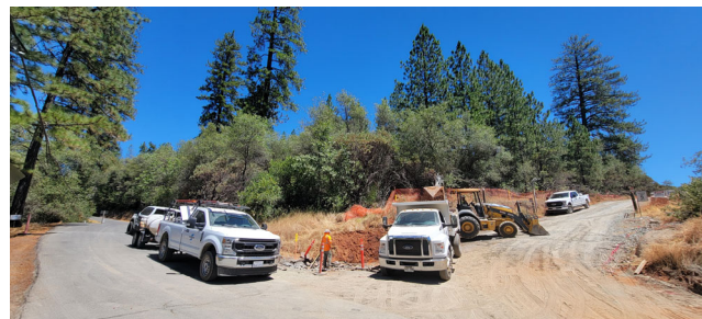
7/26/24 – DS#8 Ditch Excavation Adjacent to Mosquito Rd.