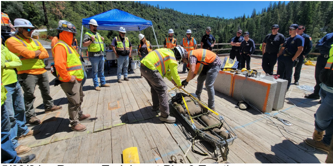
5/09/24 – Rescue Training at Pier 3 Trestle