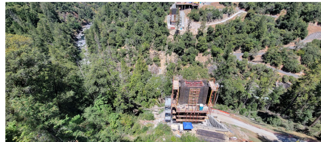
6/28/24 – Piers 2 & 3 Lift 3 Form Placement