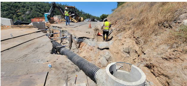
7/11/24 – DS#4 Installed Pipe & Backfill on Mosquito Rd.