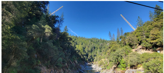
6/17/24 – View Dueling Cranes from Old Mosquito Bridge