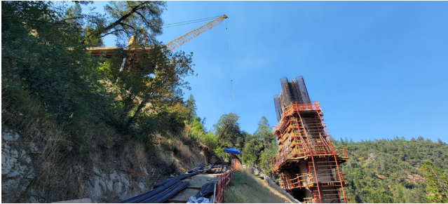
7/22/24 - Pier 2 Lift 4 Rebar Placement