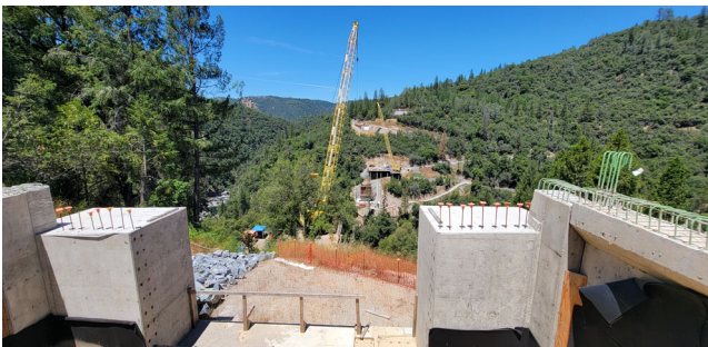
6/05/24 - View on Alignment Looking North From Abutment 1