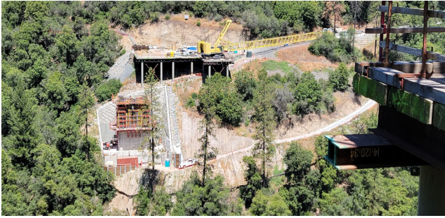
6/05/24 – View Across Canyon at Pier 3 Crane Maintenance