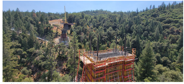
7/20/24 – Began Pier 3 Lift 4 Rebar Support Placement