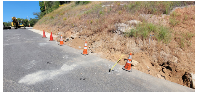
5/29/24 – Mobilize Excavator & Began DS#4 Under Full Closure