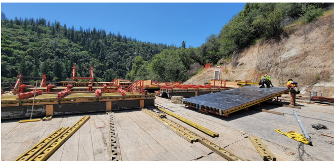
5/20/24 – Pier 3 Lift 2 Form Preparation at Pier 3 Trestle