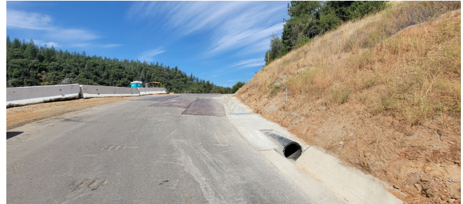
7/24/24 – DS#4 Concrete Lined Ditch Completed