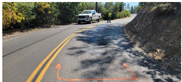
7/11/24 – Layout Road Repairs on South Mosquito Rd.