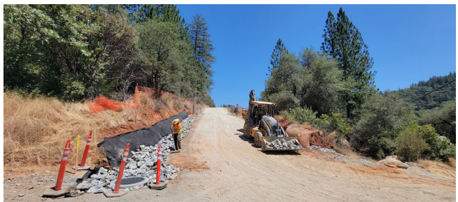
7/30/24 - DS#8 Installation of Rock Ditch Lining