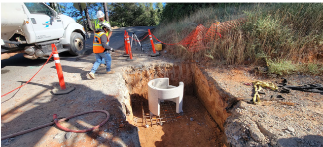
6/18/24 – Placed DS#8 Inlet at Closed Mosquito Rd.