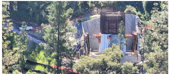
5/09/24 – Pier 2 Lift 2 Forms Stripped / Placing Concrete Cure