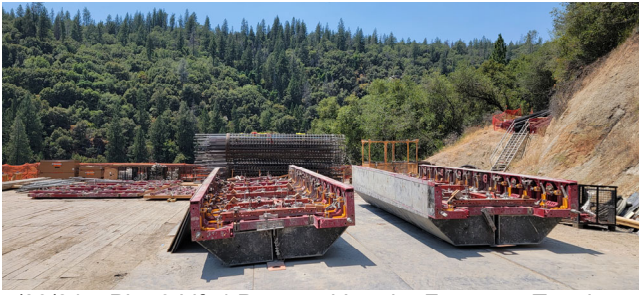
7/20/24 – Pier 3 Lift 4 Prepared Interior Forms on Trestle