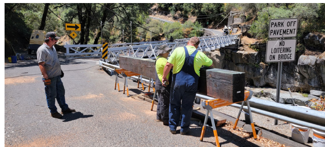
7/16/24 – Replaced Structural Member on Old Mosquito Bridge