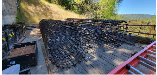
6/05/24 – Pier 2 Lift 3 Column Reinforcement Fabrication