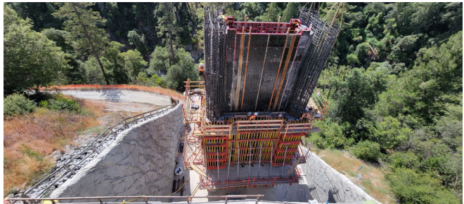
6/18/24 – Continued Pier 3 Lift 3 Rebar Placement