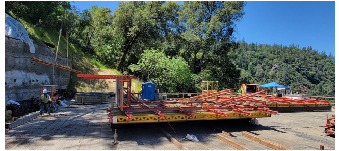
5/15/24 – Pier 2 Lift 2 Form Preparation at Pier 2 Trestle