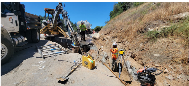
6/28/24 – Hard Rock Excavation at DS#4 on Mosquito Rd.