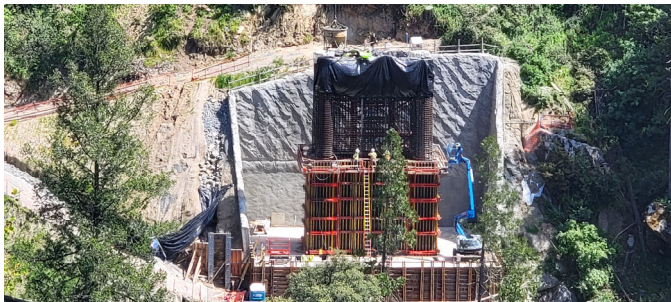
5/03/24 – Pier 2 Lift 1 Placed Concrete / Placing Rebar Lift 2