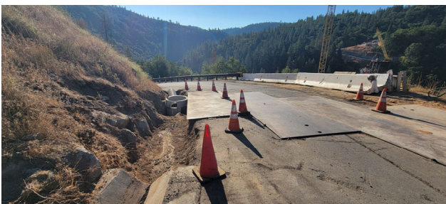
7/08/24 – DS#4 Inlet and Pipe Placement on Mosquito Rd.