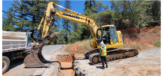
6/13/24 – Began DS#8 Construction on Closed Mosquito Rd.