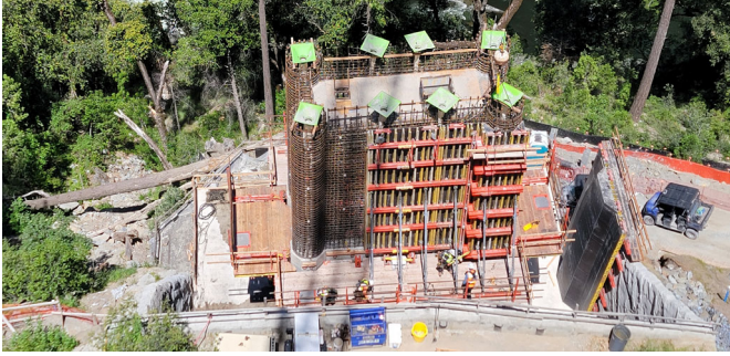
5/15/24 – Pier 2 Lift 2 Form Placement