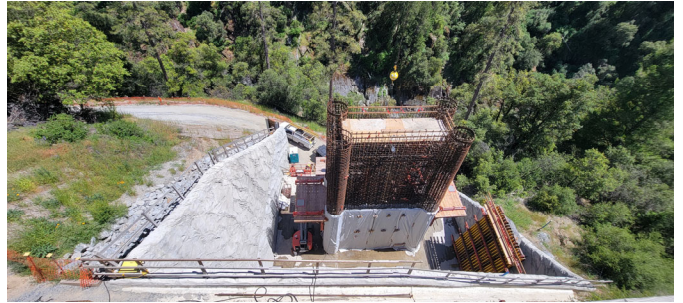
5/15/24 – Pier 3 Lift 1 Concrete and Cure Placed / Lift 2 Rebar