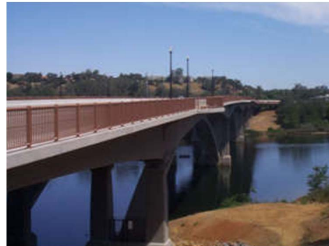
Lake Natoma Crossing, Folsom