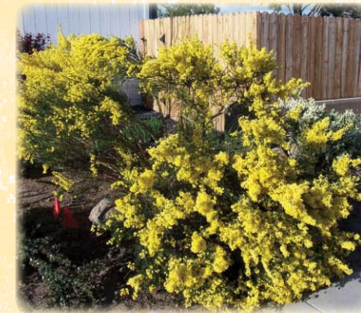
Brooms: Scotch broom ( Cytisus scoparius ), Spanish broom ( Spartium junceum ), French broom ( Genista monspessulana )