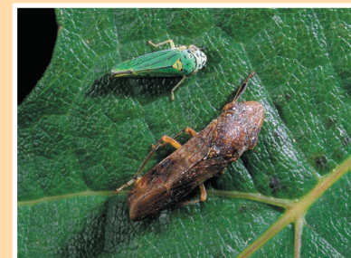
The glassy-winged sharpshooter is shown next to the smaller blue-green sharpshooter.

Early detection of the glassy-winged sharpshooter in noninfested areas of California is important for developing control strategies. A map showing areas in California infested by glassy-winged sharpshooter can be found on the California Department of Food and Agriculture Pierce's Disease Control Program website at http://www.cdffa.ca.gov/pdcp/map_index.html . Yellow sticky traps are useful for detecting and monitoring the glassy-winged sharpshooter. Plants can be checked visually or by using a sweep net. Look for adult insects, nymphs, and egg masses.