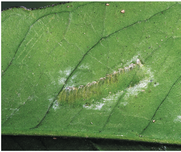
Glassy-winged sharpshooter eggs are laid together on the underside of leaves, usually in groups of 10 to 12. The egg masses appear as small, greenish blisters. These blisters are easier to observe after the eggs hatch, when they appear as tan to brown scars on the leaves.