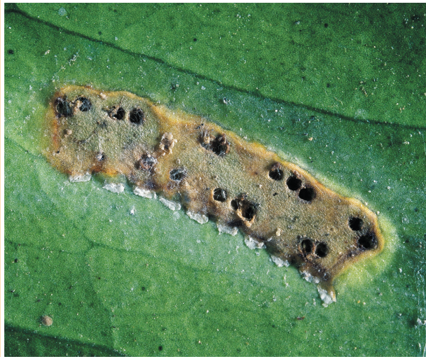
Parasitized egg masses are tan to brown with small, circular holes at one end of the eggs.