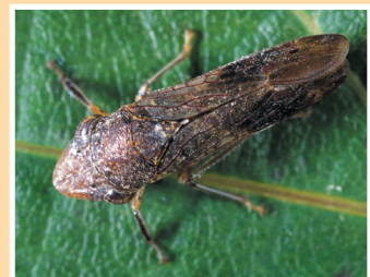
Glassy-winged sharpshooters are large insects, about 1/2 inch long.

For recommendations on controlling sharpshooters please contact your local UC Cooperative Extension office, County Agricultural Commissioner, nursery, or similar source.