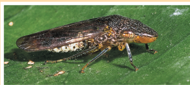
The glassy-winged sharpshooter gets its name from its transparent wings.

tural crops, urban landscapes, native woodlands, and riparian vegetation. It feeds on hundreds of plant species including woody plants and annual and perennial herbaceous plants. It occurs in high numbers on citrus. Common landscape host plants include bird of paradise, cottonwood, crape myrtle, eucalyptus, euonymus, hibiscus, pittosporum, sunflower, and xylosma, among many others. On most plants it feeds on stems rather than leaves. When feeding, it excretes copious amounts of watery excrement in