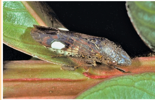
Female with white secretions on the wings that she uses to cover newly laid egg masses.

This informational brochure was produced by ANR Communication Services for the University of California Pierce's Disease Research and Emergency Response Task Force in 2000 and updated in 2018. You may download a copy of the brochure from the California Department of Food and Agriculture Pierce's Disease Control Program website at http://www.cdffa.ca.gov/pdcp/ .