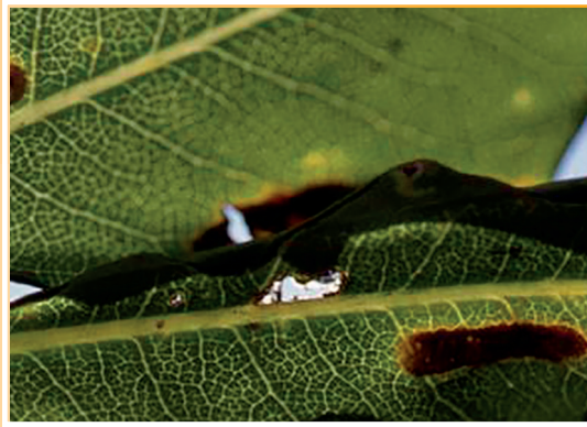
The brown scars left by the egg masses on the underside of the leaf are easier to see after the nymphs emerge from the eggs. A leaf may have more than one egg mass.

Download a copy of this brochure from http://www.cdffa.ca.gov/pdcp/