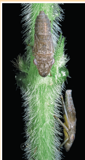
The immature nymphs are wingless.

Native to the southeastern United States and northeastern Mexico, this insect was first observed in California in 1990 and is now established in portions of Central and Southern California. It is a particular threat to California vineyards due to its ability to spread Xylella fastidiosa , the bacterium that causes Pierce's disease. Pierce's disease kills grapevines, and there are no effective treatments for it. The glassy-winged sharpshooter led to a Pierce's disease epidemic in Southern California in 1999 and it continues to pose a threat to viticulture throughout the state.