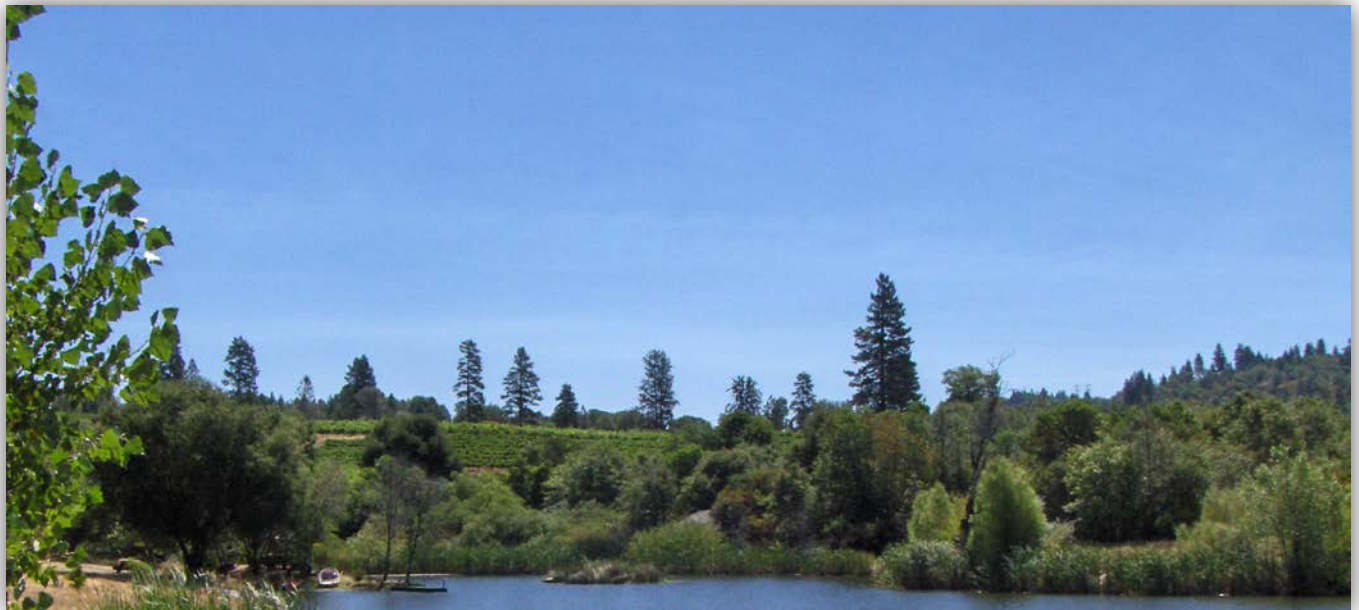
Local vineyard certified through the Fish Friendly Farming program.