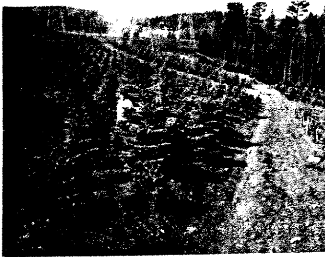
Pictures portray tree growth attained in two years in the same planting.

EL DORADO COUNTY DEPARTMENT OF AGRICULTURE