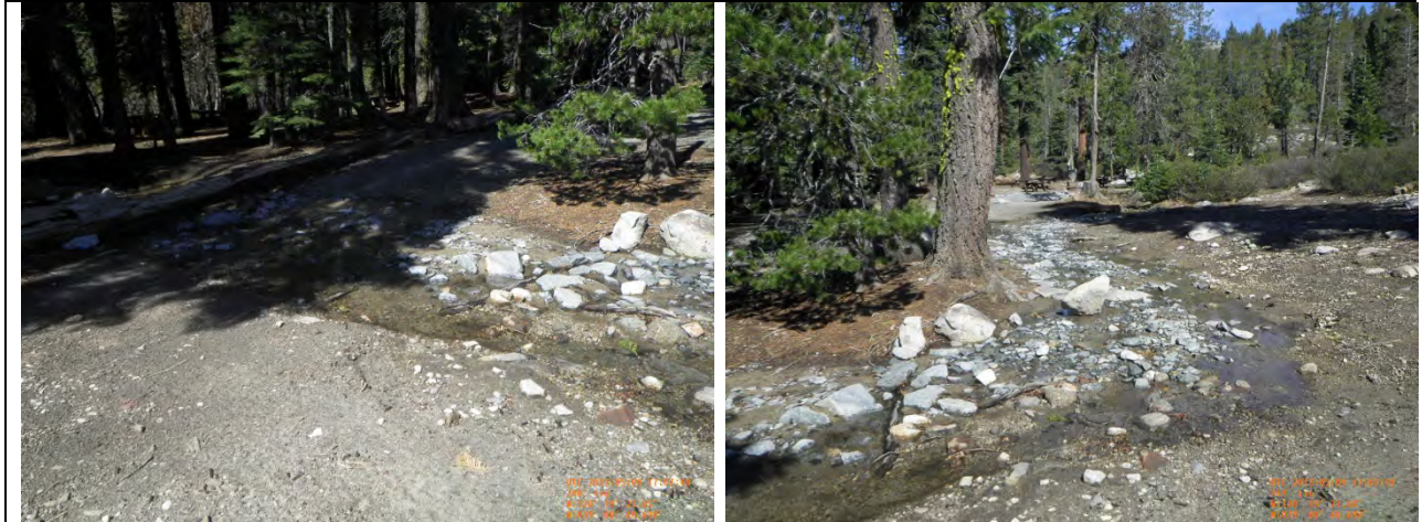
Wentworth Springs Campground