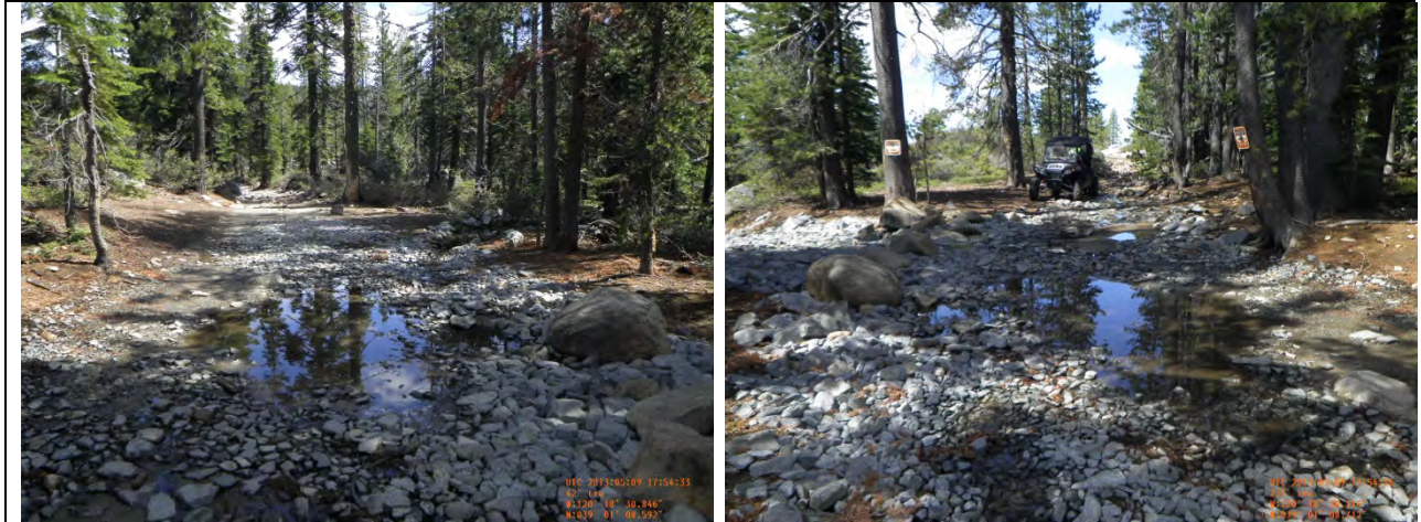
Ellis Creek Intertie