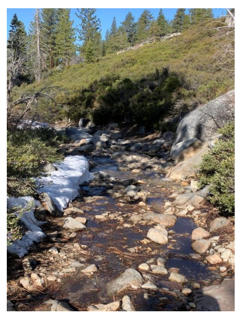
Post Pile RT Station 68+00 Water Depths: 0.41', 0.41', 0.166'

Notes: BMP's were functioning as designed, some rocks were moved and the leadoff ditch was widened to create more area for runoff.