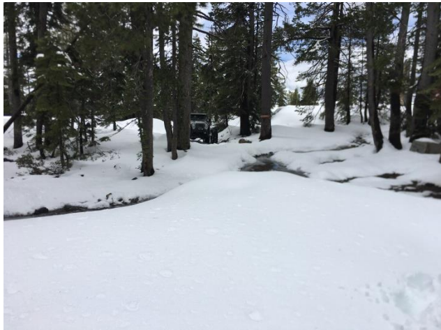
Intertie RT Station 115+00