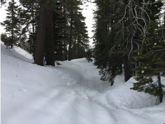
Walker Hill RT Station 165+00