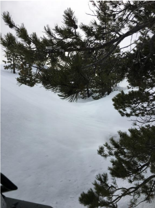
Little Sluice RT Station 212+00

Notes: BMP's in this location were not visible. Snow depth in this area was approximately 10-12 feet deep. Run off was not visible and tracks in photos were from County staff.