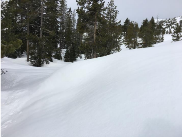
Soup Bowl RT Station 195+00

Notes: No BMP's were exposed at this site. Snow depth in this area was approximately 10-12 feet with no run off visible.