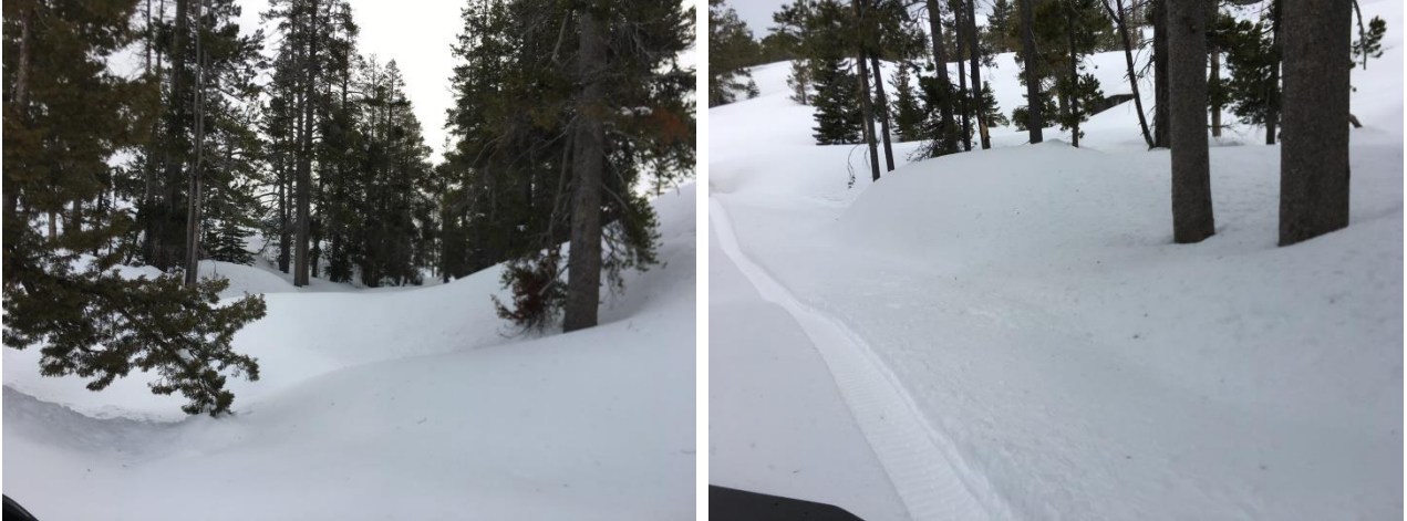
Winter Camp RT Station 205+00