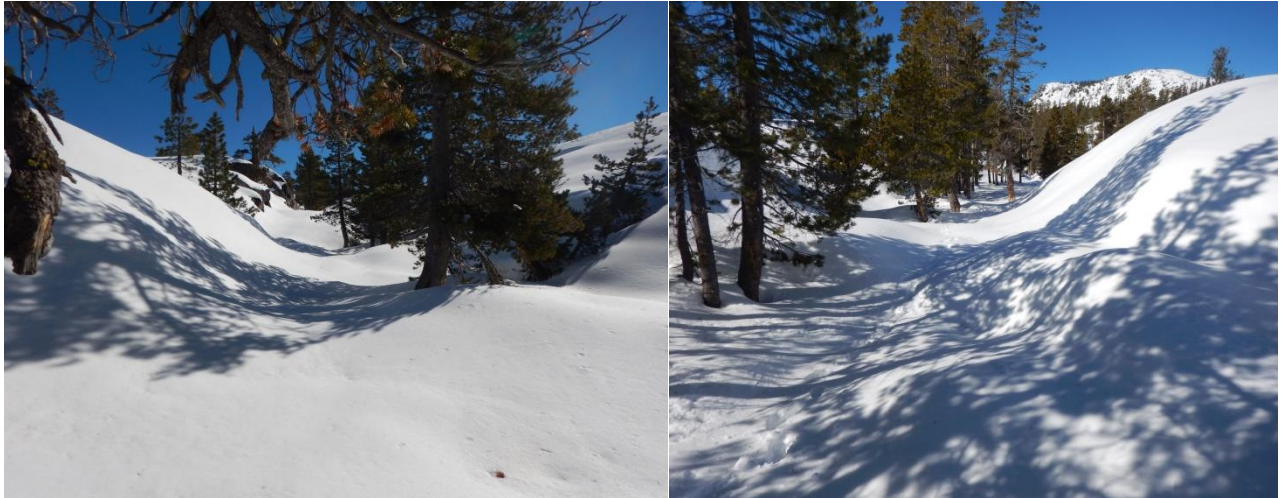
Little Sluice RT Station 212+00

Notes: BMP's in this location were not visible. Snow depth in this area was approximately 4-5 feet deep. Run off was not visible and tracks in photos were from county staff.