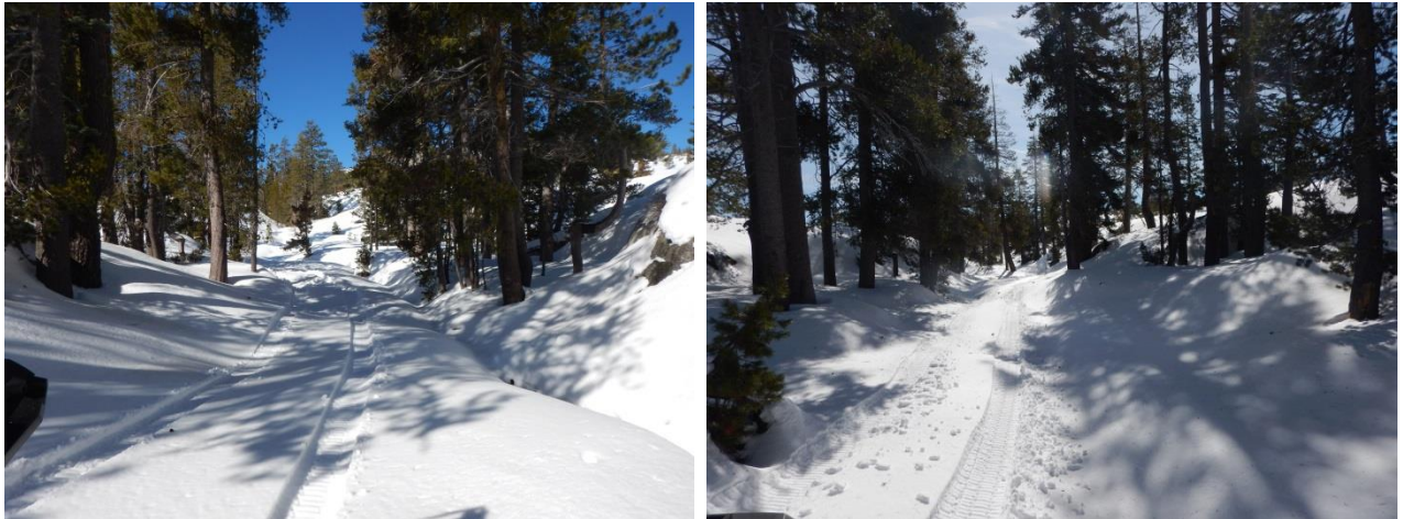
Winter Camp RT Station 205+00