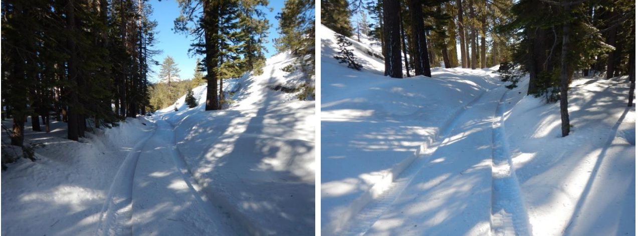
Walker Hill RT Station 165+00