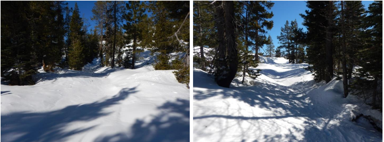
Soup Bowl RT Station 195+00

Notes: No BMP's were exposed at this site. Snow depth in this area was approximately 4-5 feet with no run off visible and tracks in photos were from county staff.