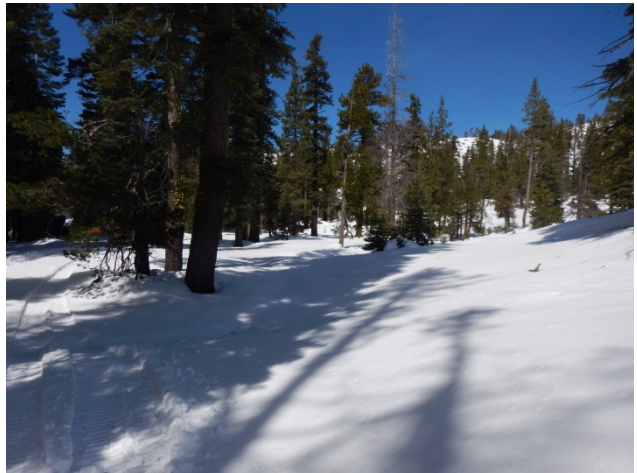
Wentworth Springs Campground