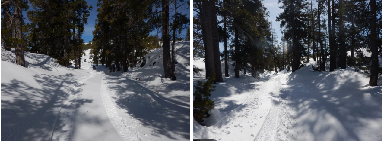
Winter Camp RT Station 205+00