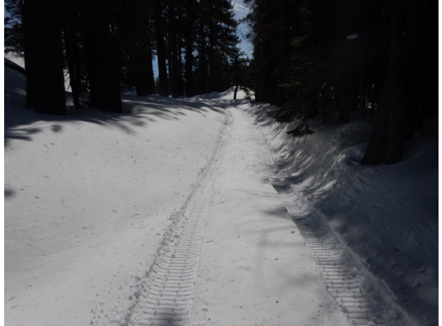
Walker Hill RT Station 165+00