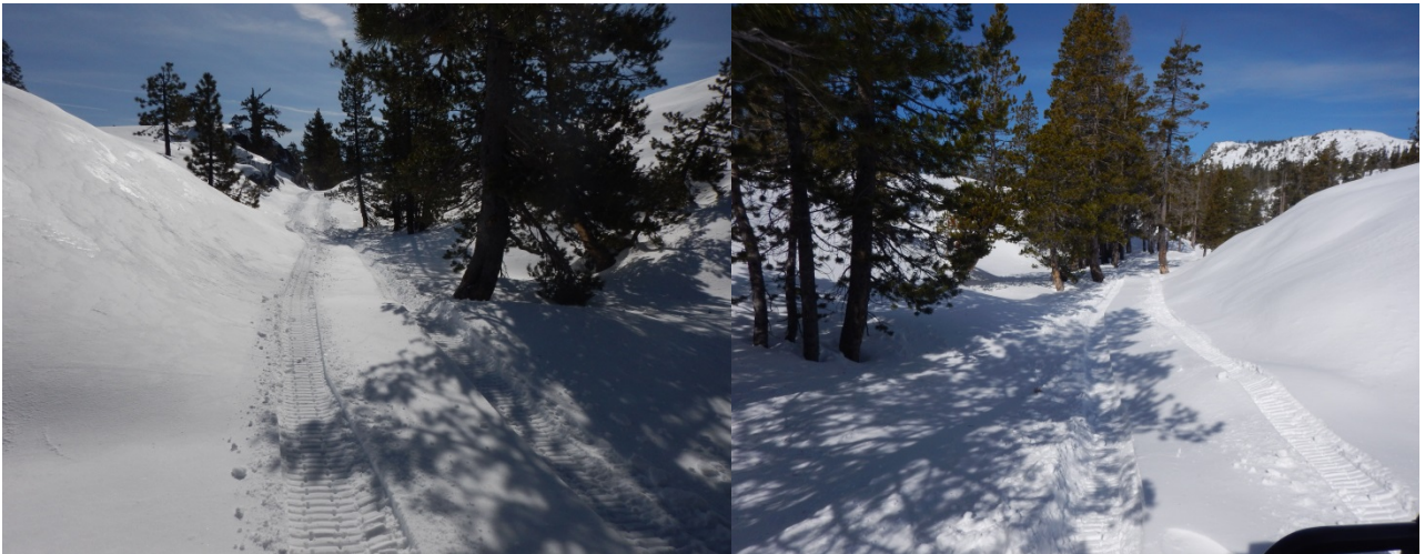
Little Sluice RT Station 212+00

Notes: BMP's in this location were not visible. Snow depth in this area was approximately 4-5 feet deep. Run off was not visible.