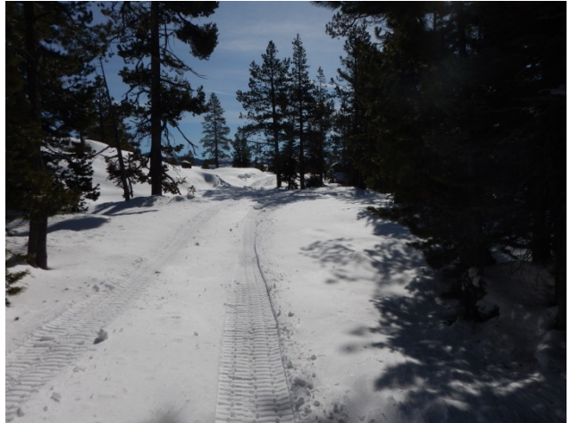
Soup Bowl RT Station 195+00