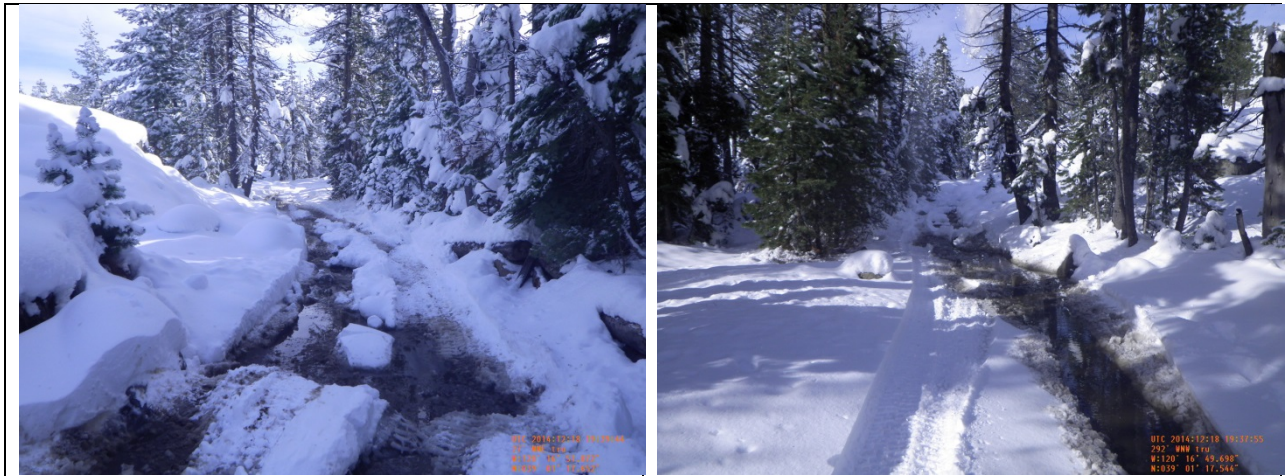
Soup Bowl RT Station 198+40

Notes: The Rock Slope Protection (RSP) was covered in snow. There was runoff observed flowing down the hardened surface of the Trail.