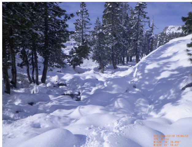
Little Sluce RT 213+50

The Rock Fill (RF) was exposed with runoff observed flowing over the RF. The measurements at this location are below the .7' standard therefore Condition 2 is no longer met.