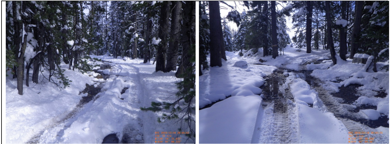
Ellis Creek Intertie RT Station 99+86

Notes: The Rock Ditch Crossing (RDX) was observed and was functioning as designed. Runoff was observed flowing down the hardened surface of the Trail.