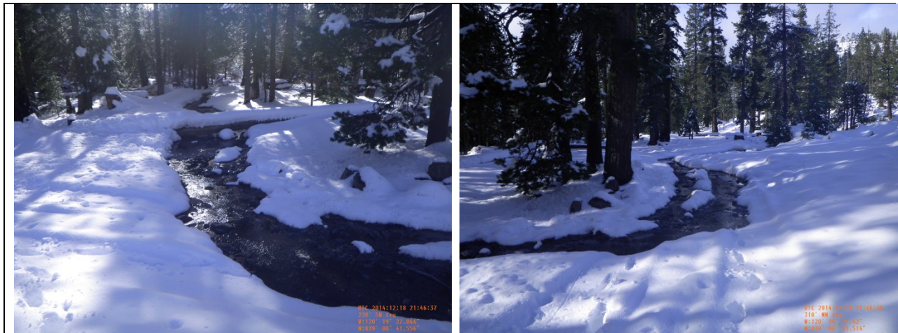
Wentworth Springs Campground RT Station 33+65