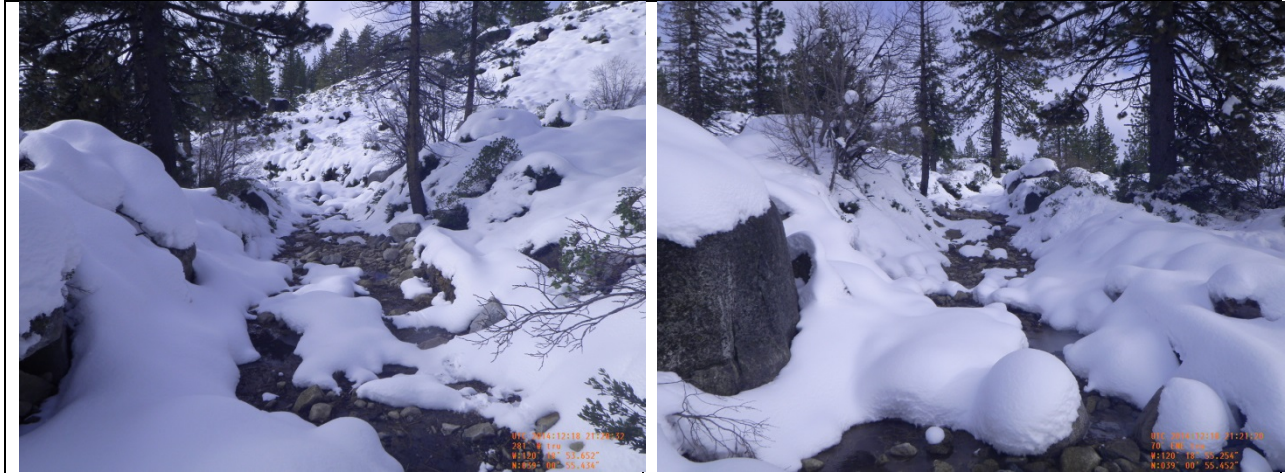
Post Pile RT Station 75+00