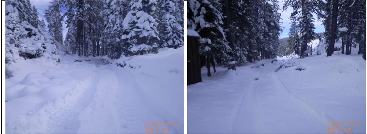
Walker Hill RT Station 170+80