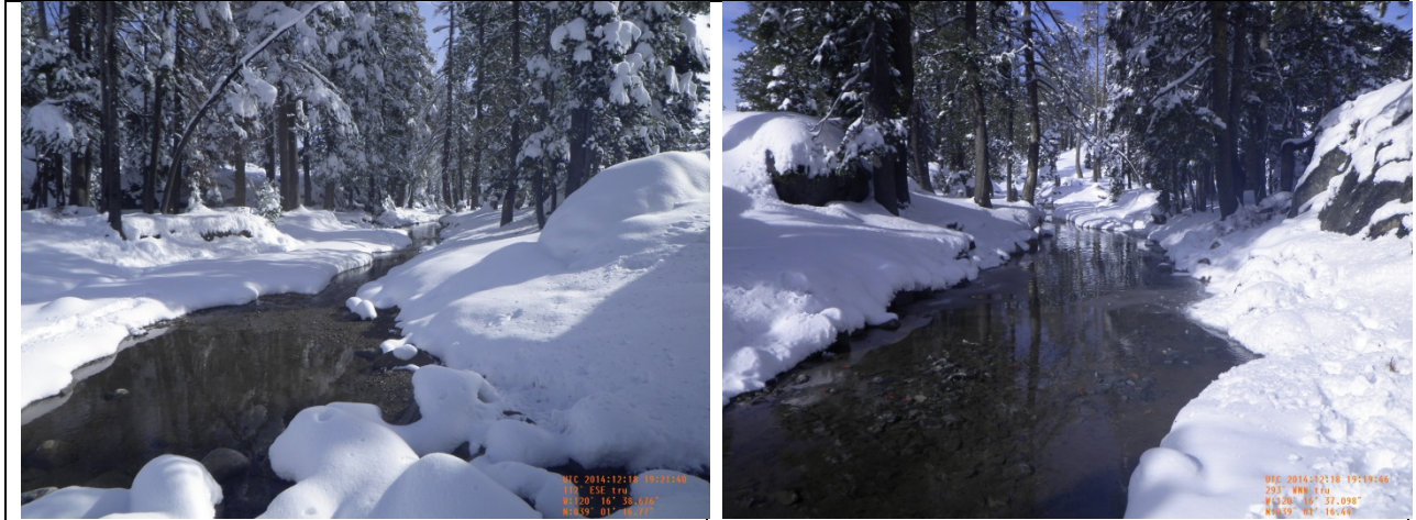
Winter Camp RT Station 209+58