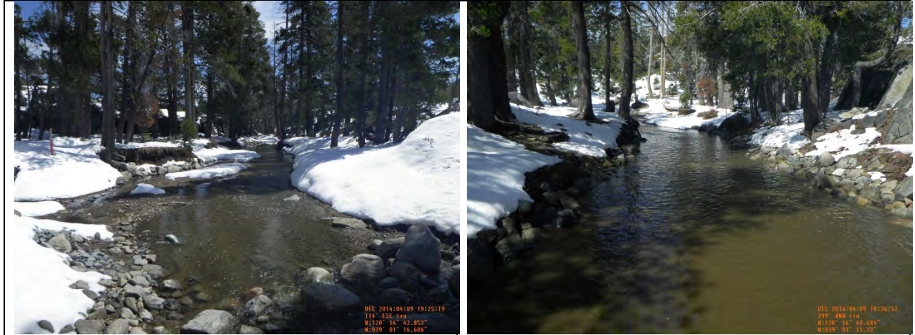
Winter Camp RT Station 209+58.39

Water Depth: 0.6', 0.6', 0.9' (Average: 0.70')