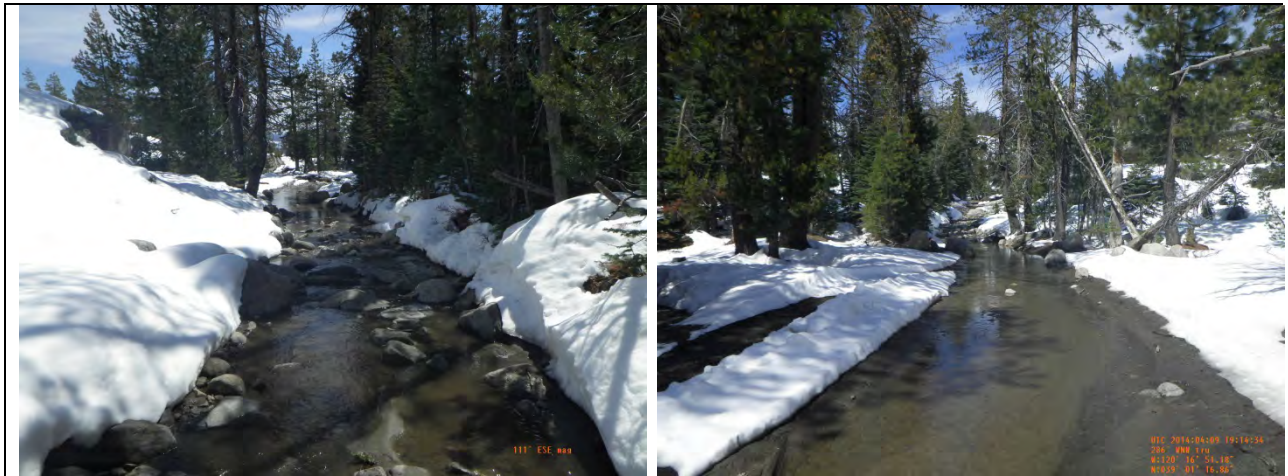
Soup Bowl RT Station 198+40.84

Notes: The Rock Slope Protection (RSP) was not fully exposed on both sides of the Trail. There was snow melt run-off flowing down the hardened surface of the Trail, which discharges into a Rock Energy Dissipator.