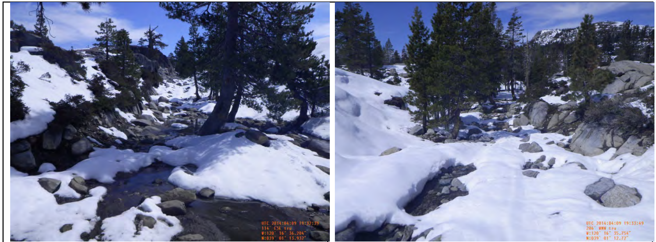
Little Sluice RT 213+50.32

The Rock Fill (RF) was exposed through the snow. Where visible, the run off was flowing over the RF.