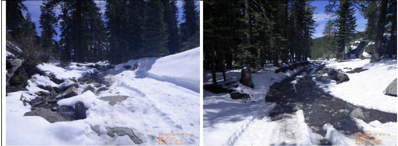
Walker Hill RT Station 170+80

Water Depths: 0.2', 0.3', 0.4' (Average: 0.30')