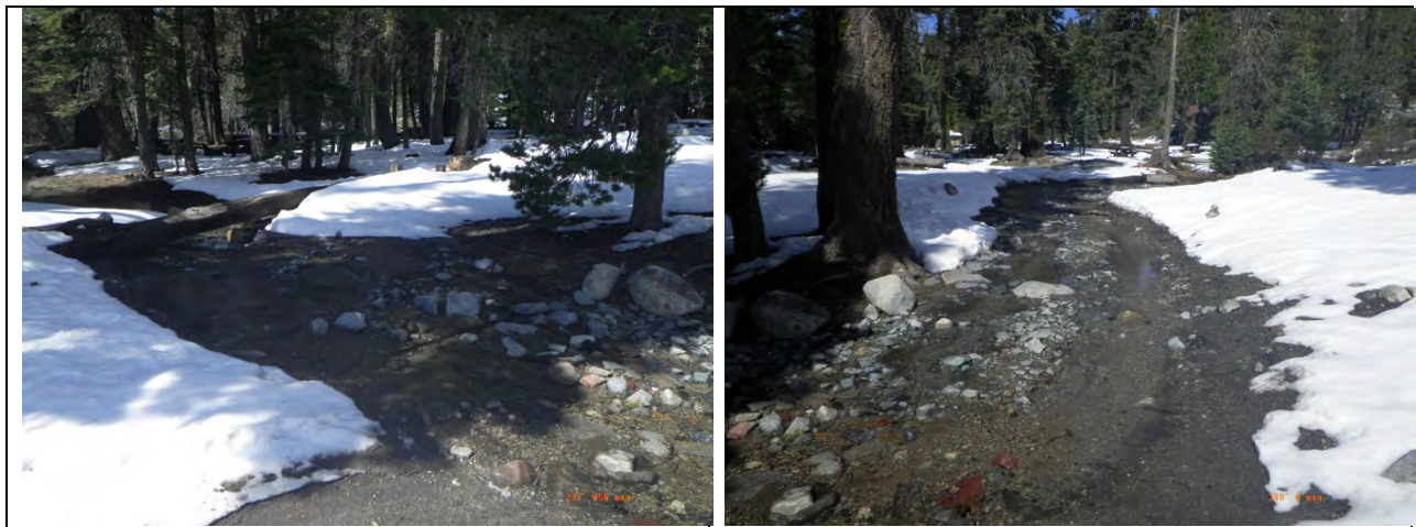
Wentworth Springs Campground RT Station 33+65.67

Water Depths: 0.1', 0.2', 0.2' (Average: 0.17')