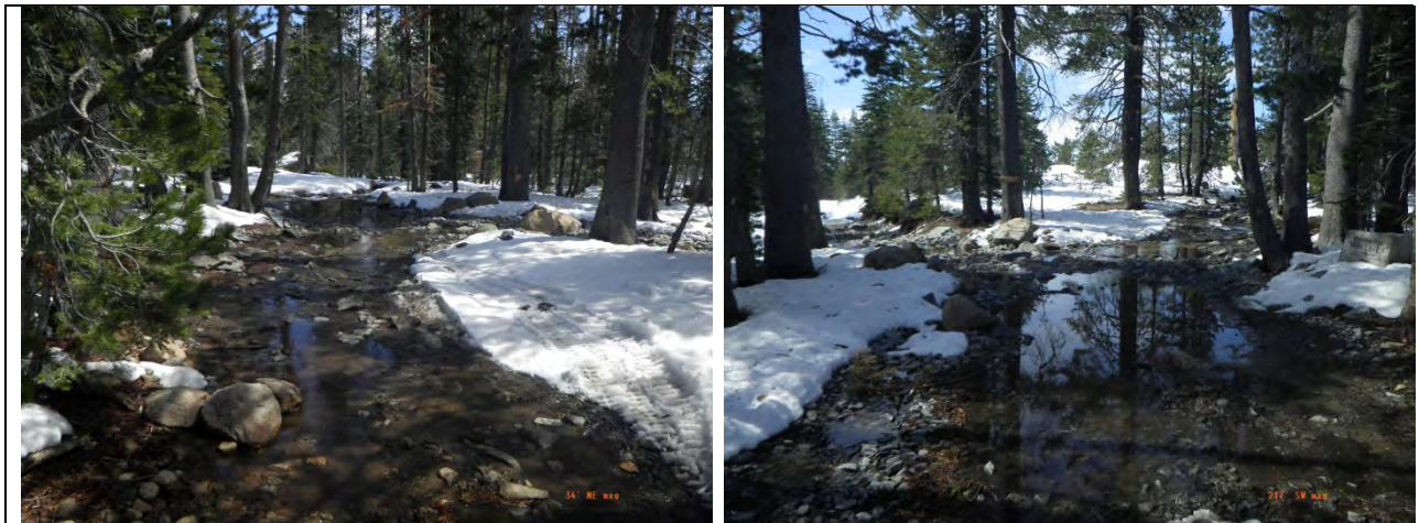
Ellis Creek Intertie RT Station 99+86.95

Notes: The Rock Ditch Crossing (RDX) was observed and was functioning as designed. Snow melt run-off was observed flowing down the hardened surface of the Trail.