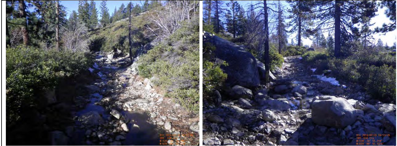
Post Pile RT Station 75+00

Water Depths: 0.3', 0.3', 0.4' (Average: 0.33')