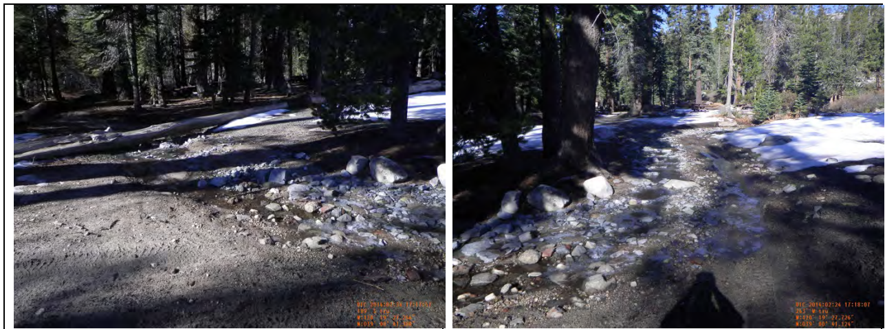
Wentworth Springs Campground RT Station 33+65.67

Water Depths: 0.1', 0.2', 0.2' (Average: 0.17')