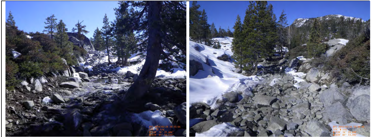
Little Sluice RT 213+50.32

The Rock Fill (RF) was not fully exposed through the snow. Where visible, the run off was flowing over the RF.