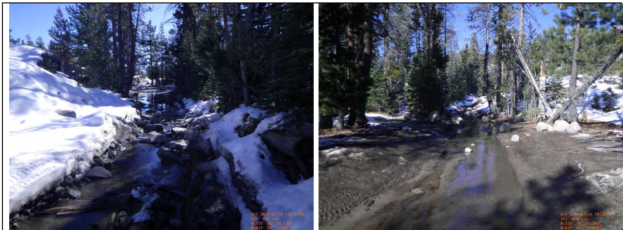
Soup Bowl RT Station 198+40.84

Notes: The Rock Slope Protection (RSP) was not fully exposed on both sides of the Trail. There was minimal snow melt run-off flowing down the hardened surface of the Trail, which discharges into a Rock Energy Dissipator.