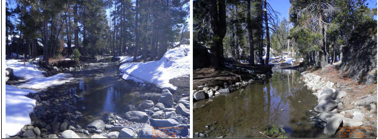
Winter Camp RT Station 209+58.39

Water Depth: 0.8', 0.8', 0.9' (Average: 0.83')