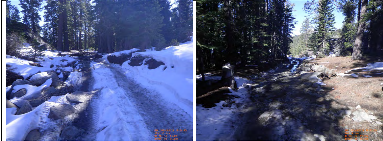
Walker Hill RT Station 170+80

Water Depths: 0.1', 0.1', 0.2' (Average: 0.13')