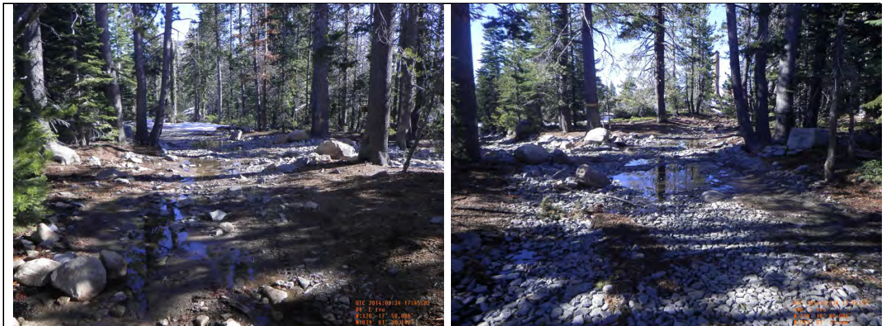
Ellis Creek Intertie RT Station 99+86.95

Notes: The Rock Ditch Crossing (RDX) was observed and was functioning as designed. Snow melt run-off was observed flowing down the hardened surface of the Trail.