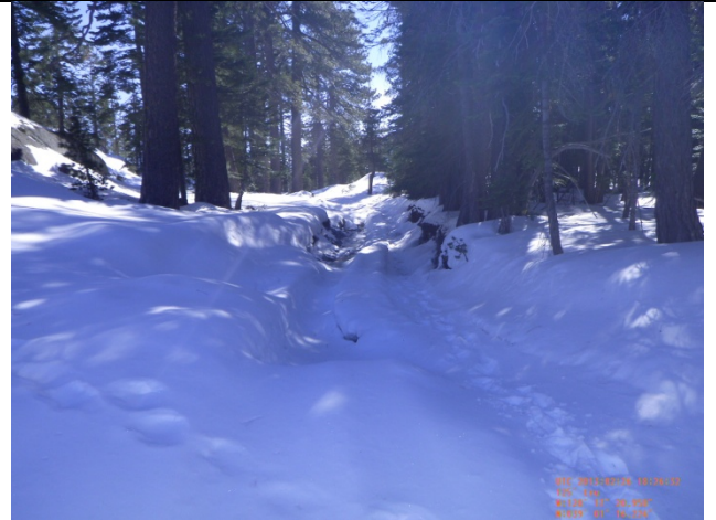
Walker Hill RT Station 170+80 Water Depth: 0.1'

There was run off that was moving from the trail and into Ellis Creek. The water that was going into the creek was clear with no signs of sediment evident.