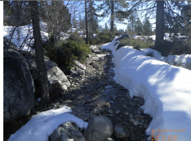
Post Pile RT Station 75+00 Water Depth: 0.3'

The Rock Ditch Crossing (RDX) was exposed through the snow, with run off moving across the RDX. The water was clear with now signs of sediment moving in the water.