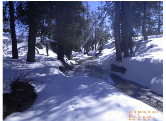
Winter Camp RT Station 209+58.39 Water Depth: 0.3'

The Rock Ditch Crossing (RDX) was exposed through the snow with run off moving through it. The water that was moving through the RDX was clear and did not appear to have signs of sediment.