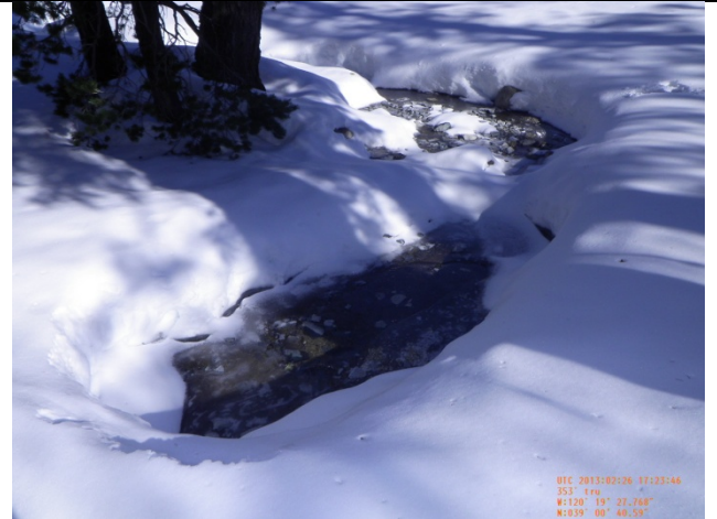
Wentworth Springs Camp Ground RT Station 33+65.67 Water Depth: 0.2'

The Rock Outlet Protection (ROP) was exposed through the snow, with run off moving across the ROP. The water was clear with no signs of sediment moving in the water with the flow appearing to be moving towards the snow covered BMP.