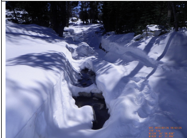
Soup Bowl RT Station 198+40.84 Water Depth: 0.3'

The Rock Slope Protection (RSP) was exposed in spots through the snow. There was minimal run off that was flowing down the trail in spots. The water was clear and did not have noticeable signs of sediment.