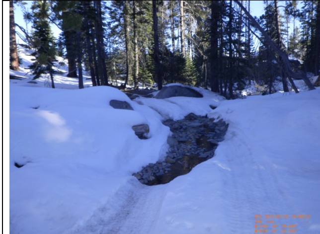
Gate Keeper LL Station 146+77.03 Water Depth: 0.4'

The Rock Outlet Protection (ROP) was exposed through the snow, with run off moving across the ROP. The water was clear with no signs of sediment moving in the water with the flow appearing to be moving towards the snow covered BMP.