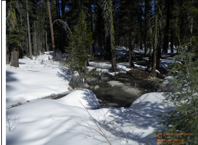
Ellis Creek RT Station 115+00 Water Depth: 0.6'

There was run off that was moving from the trail and into Ellis Creek. The water that was going into the creek was clear with no signs of sediment evident.