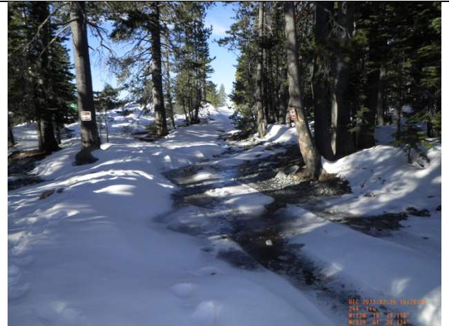
Ellis Creek Intertie RT Station 99+86.95 Water Depth: 0.2'

The Rock Ditch Crossing (RDX) was under the snow and could not be observed. Run off was seen flowing down the trail with no signs of sediment in the water.