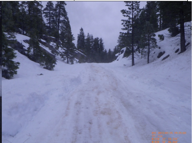
Average snow depth at Wentworth Springs Road was 29"