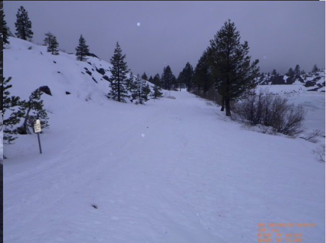
Average snow depth at Ice House Rd was 36"