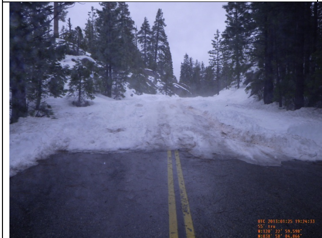
Snow berm at Wentworth Springs Road