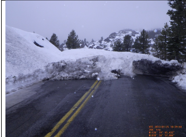
Snow berm at Ice House Rd