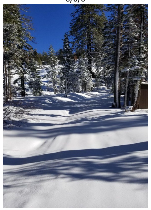
Walker Hill area was completely covered in snow

Walker Hill Rt Station 165+00 Water Depths 0/0/0