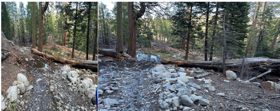
Removal of a tree that was across Scout Hole was removed.

On November 10 th , County staff put together a successful volunteer project with a few goals, including removal of downed tree at Scout Hole and blocking the illegal bypass at Hairpin. Volunteers from Jeep USA, and Rubicon Soda Springs Inc. were involved in the project.