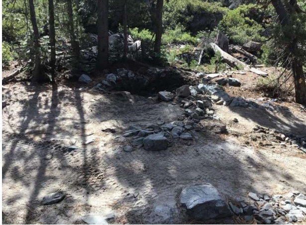
Photo of BMP work in progress