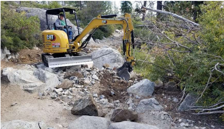
Photo of excavator working on a section of post pile.

2. The Wentworth Springs segment of the trail was adopted by Madhatter's 4X4 club. This segment of the trail is from the Wentworth Springs campground to the Intertie. Madhatter's inspected the trail in June and reported that the water bars needed to be re-established and a rock was causing trail issues. The county informed them that we would have an excavator in that segment in the fall and we would take care of the maintenance issues. We thank the club for doing their inspection.