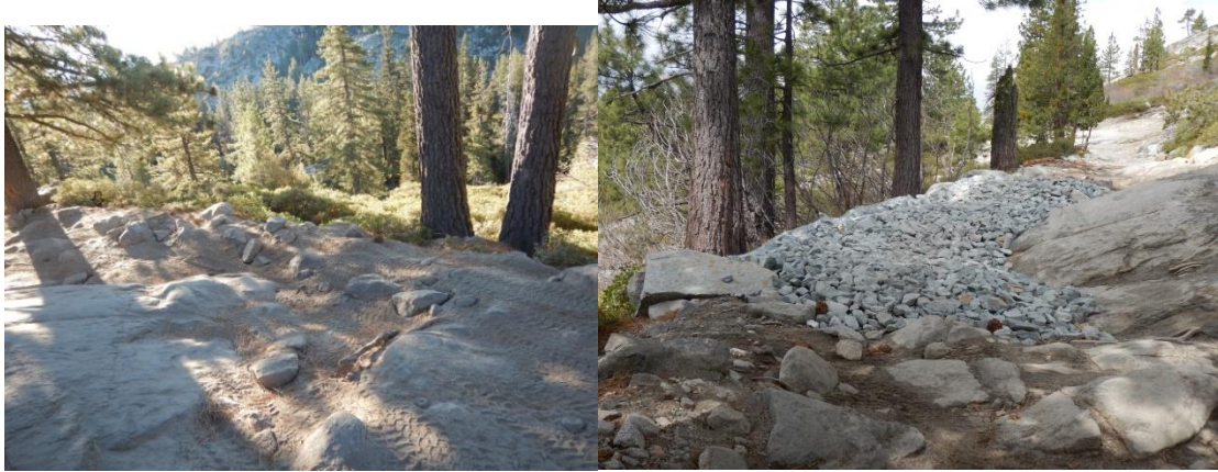
Gabion at Cell phone tree after rock was dropped by helicopter

Cell Phone Tree -The side hill of Cell Phone Tree had started to erode. A gabion was built in 2017 and in 2018 the rock was added on top of the gabion with the assistance of the helicopter.