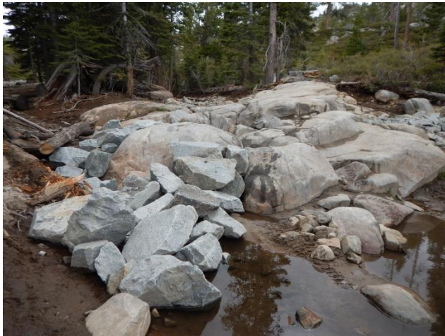
Right line of the drop before Soup Bowl