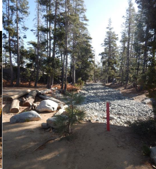
Before and after photos at Winter Camp

SMUD Bypass- Justin Williams, Chris Watts and Aaron Kinley all County employees built the large gabion at SMUD Bypass. If you take the low line at this location it would appear to be the easiest line but in reality it is the worse spot to be in. Vehicles have rolled into the vegetation which has stopped them from rolling down the hill into Buck Island Lake. A large gabion was built on the low section which prevents the tipping hazard and the threat of rolling. The gabion was topped with rock. 3 large loads, 5 medium loads; 90,000 pounds of rock was used at this location.