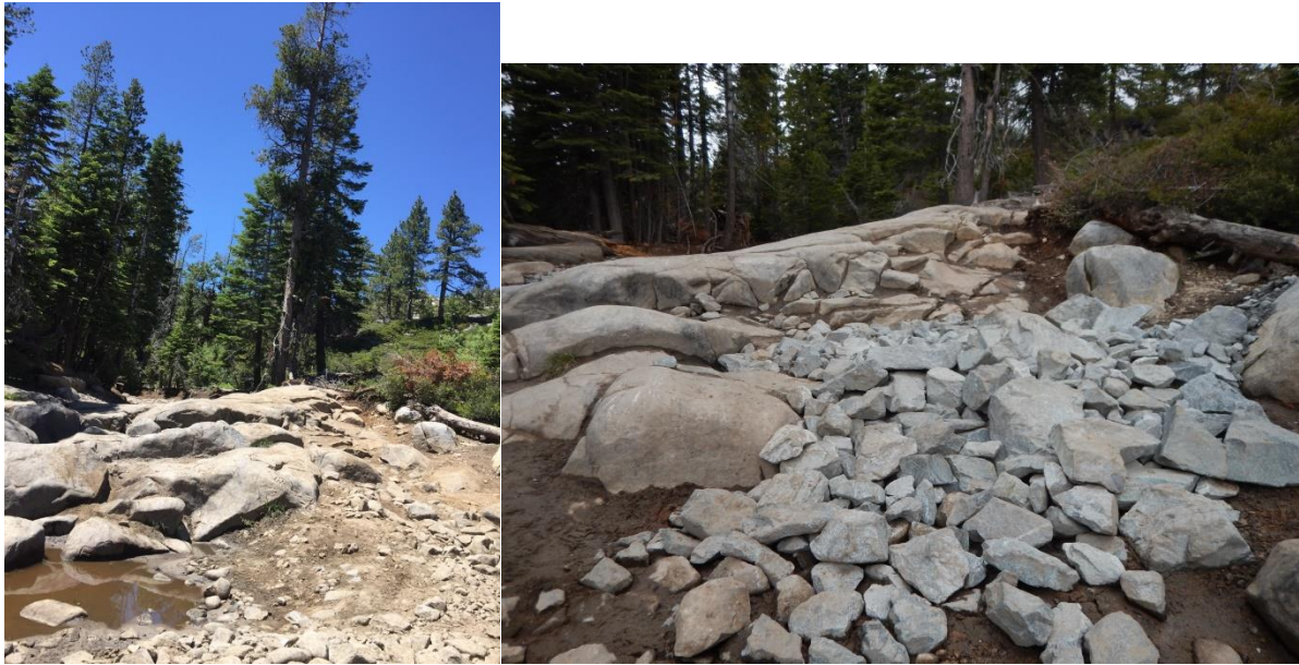
Left side of the drop before Soup bowl

Drop before Soup Bowl -Large rock was added to the left line at this location. Very large boulders were added to the right line and dropped in between the rocks.