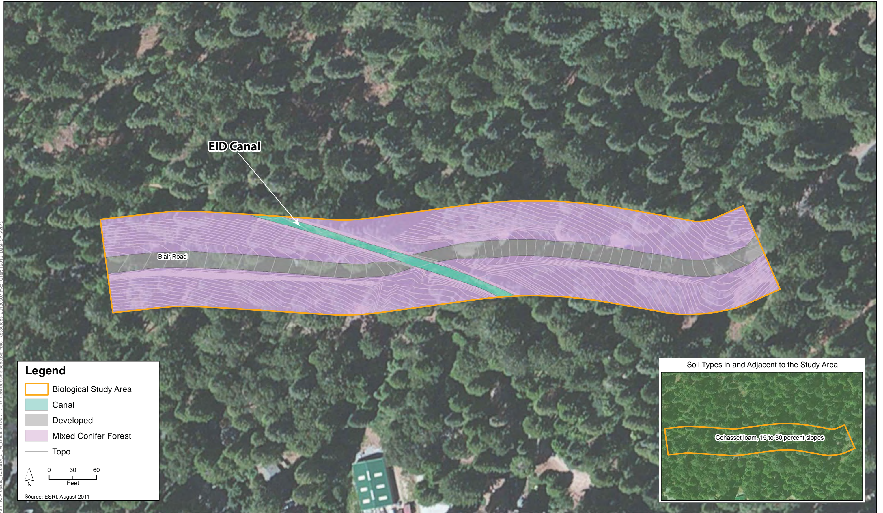
Figure 4 Landcover and Soil Types in the Blair Road Bridge Replacement Project Biological Study Area

Path: K:\Projects_1\County_of_El_Dorado\00507_12_ThreeBridges\mapdoc\BlairBio_Resources_20130507.mxd; User: 19016; Date: 5/15/2013