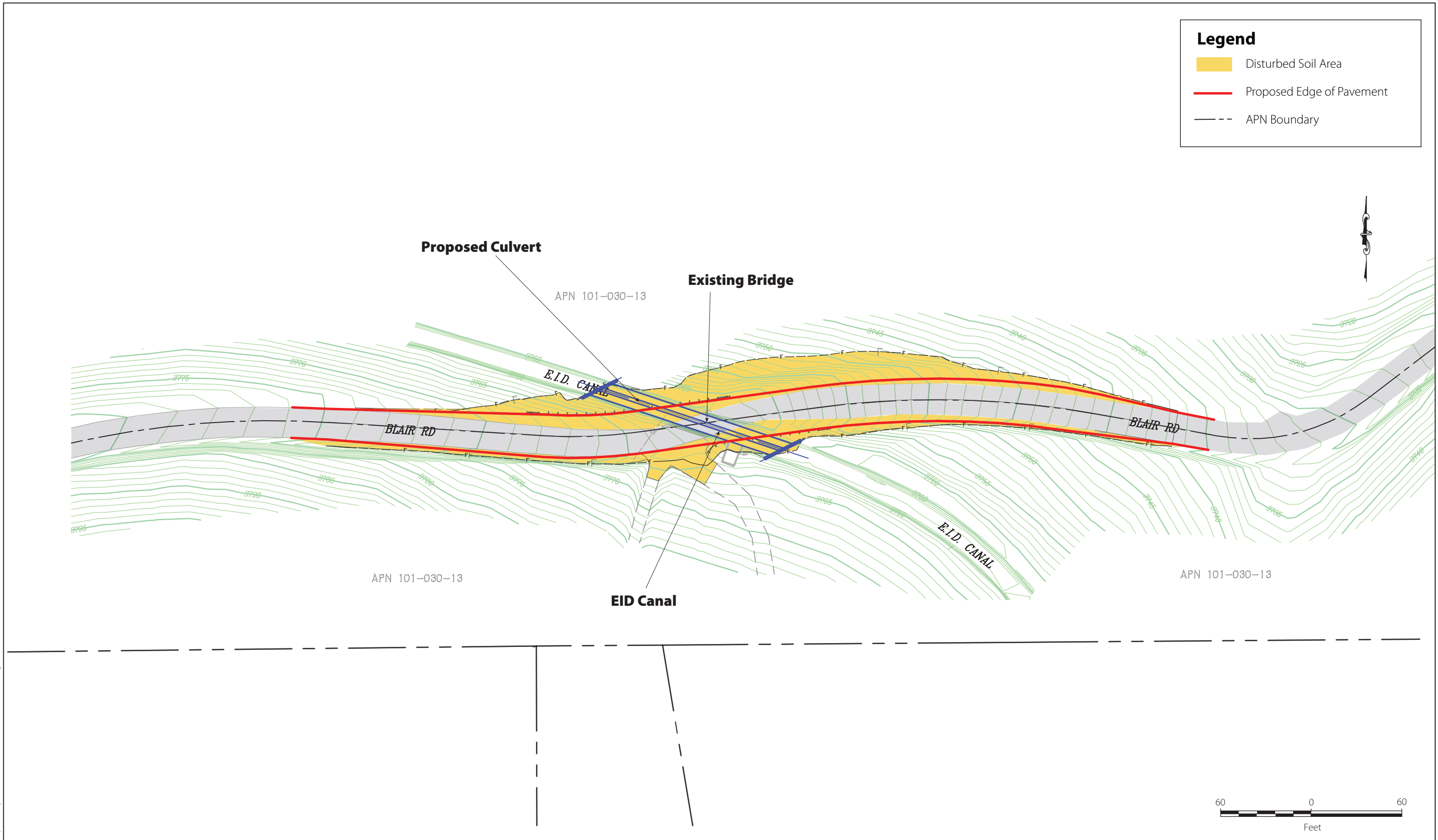
Figure 3 Blair Road Bridge Replacement Project